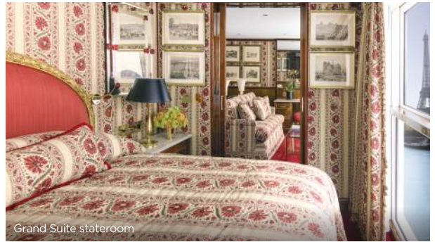
Grand Suite stateroom